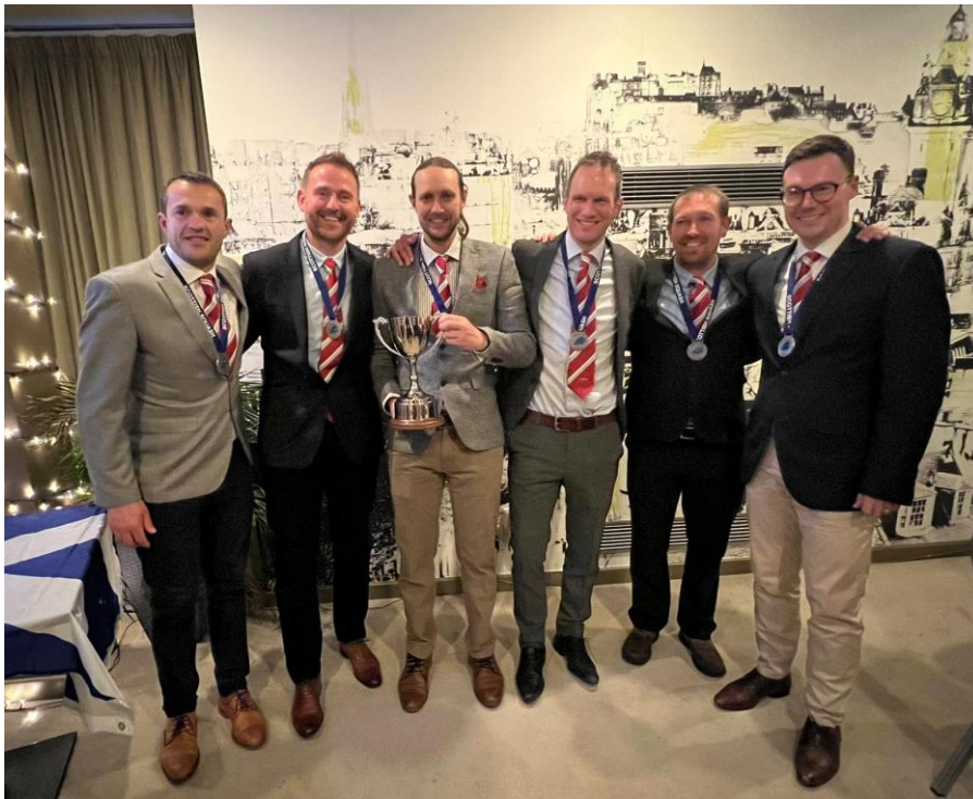
Photos 5 – Men's O40s Home International Champions 2024 – England (and proof that the Captain did make it out of the bathroom eventually!).