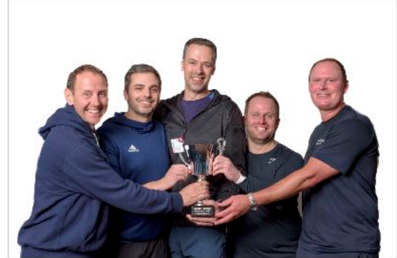
West Hants 2 Racketball Division 1: Winners