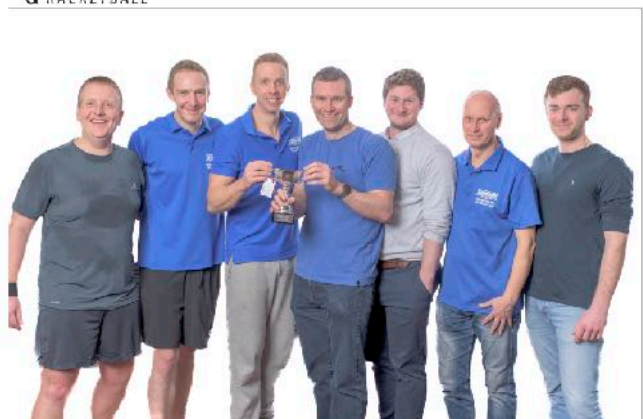
Bournemouth 2 Squash Division 2: Winners