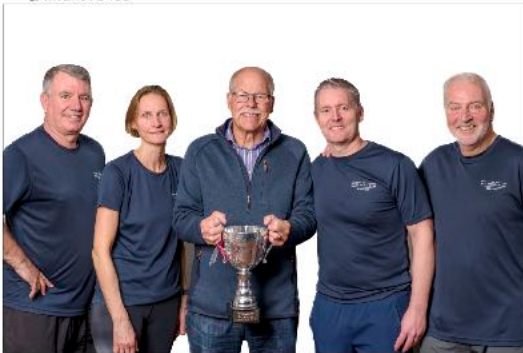
West Hants 3 Racketball Division 2: Winners