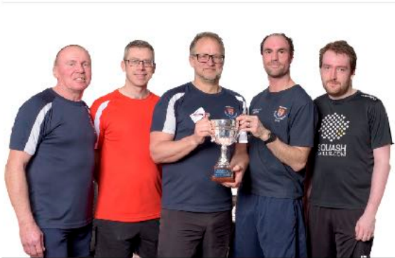
Bridport 1 Squash Division 5: Winners