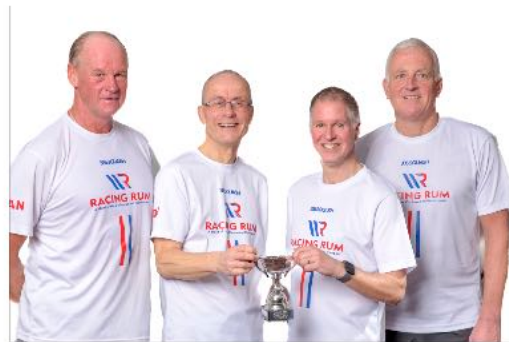
Hamworthy 2 Racketball Division 3: Winners

Racketball Winners (above): West Hants RB1, West Hants RB4 and Hamworthy RB 3.